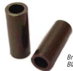
Brass Sleeves Black Finish