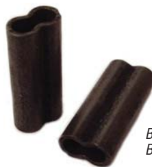
Brass Sleeves Black Finish